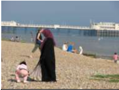
Muslim woman at a Worthing area beach

Ramadan: Ramadan, a month of prayer and fasting for Muslims, the holiest of Islam's four holy months is August 22 - September 20. It is viewed as a time for spiritual reflection, prayer, doing good deeds and spending time with family and friends.